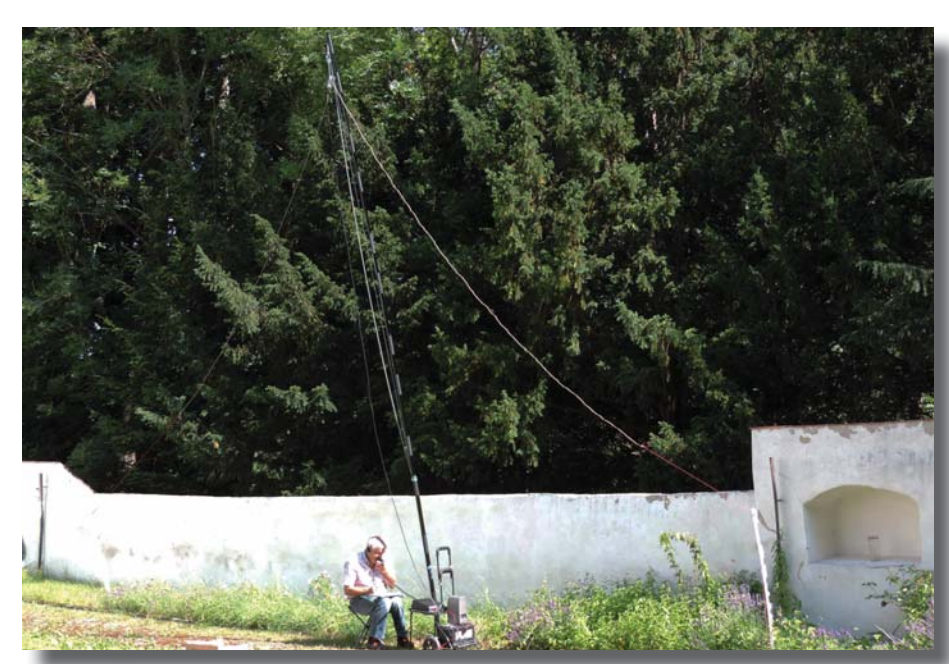
20meter station on the right side

http://blog.winqsl.com http://www.u23.de