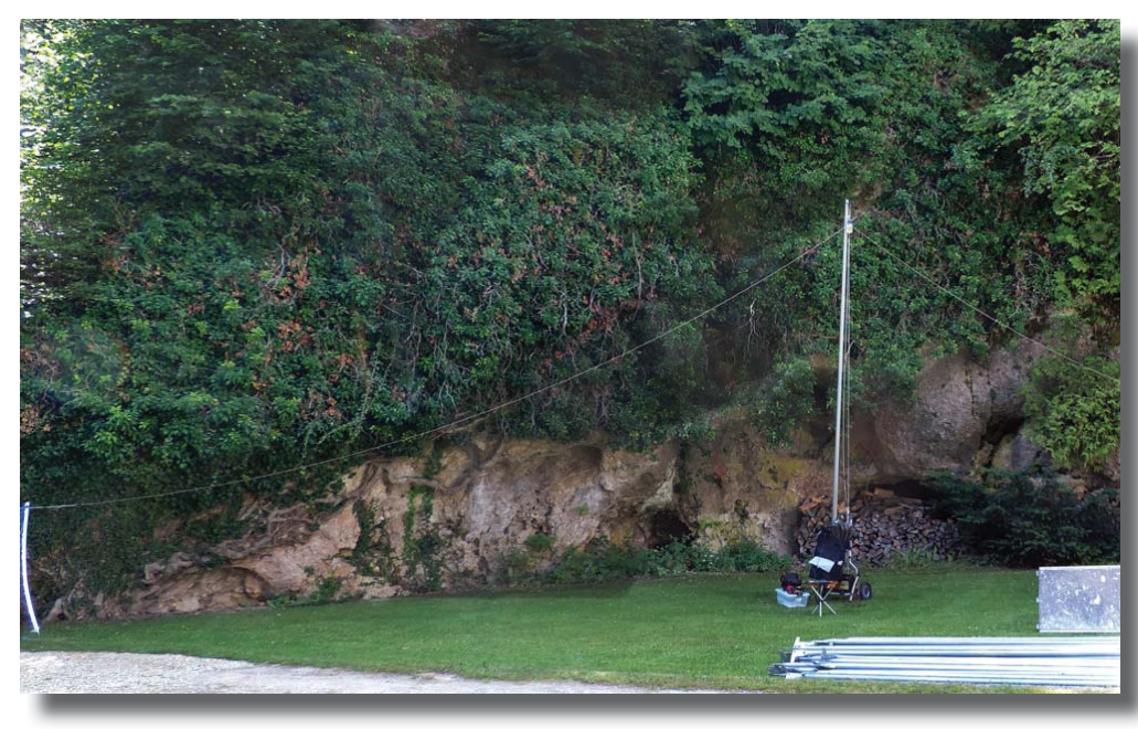
so it was very good for us, that we could enter the outer area of the castle.

To keep it short we used only a monoband dipole on each station. While Konrad DH6RAE was working on 20meters, Manfred DF6EX was handling the 40meter-station.