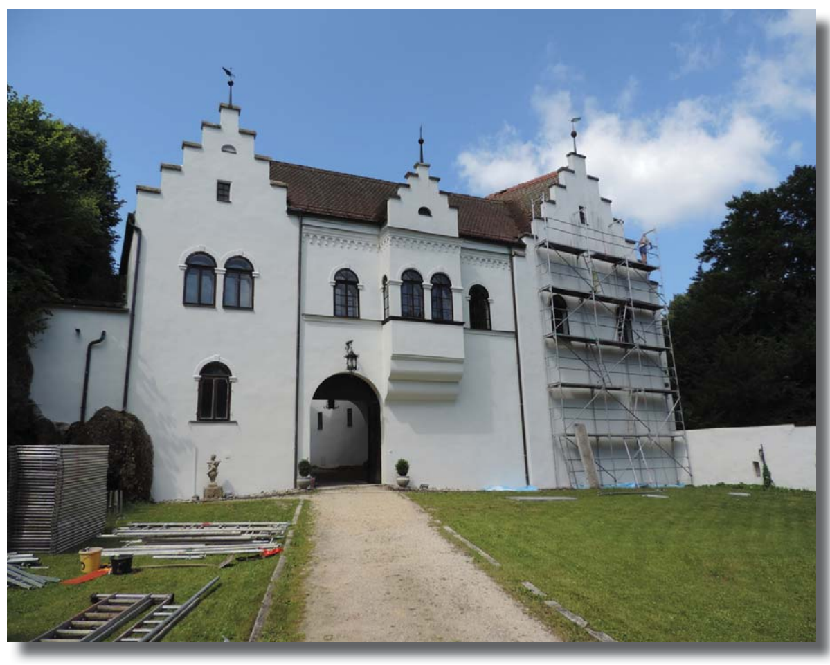
some restauration-works in the outer bawn