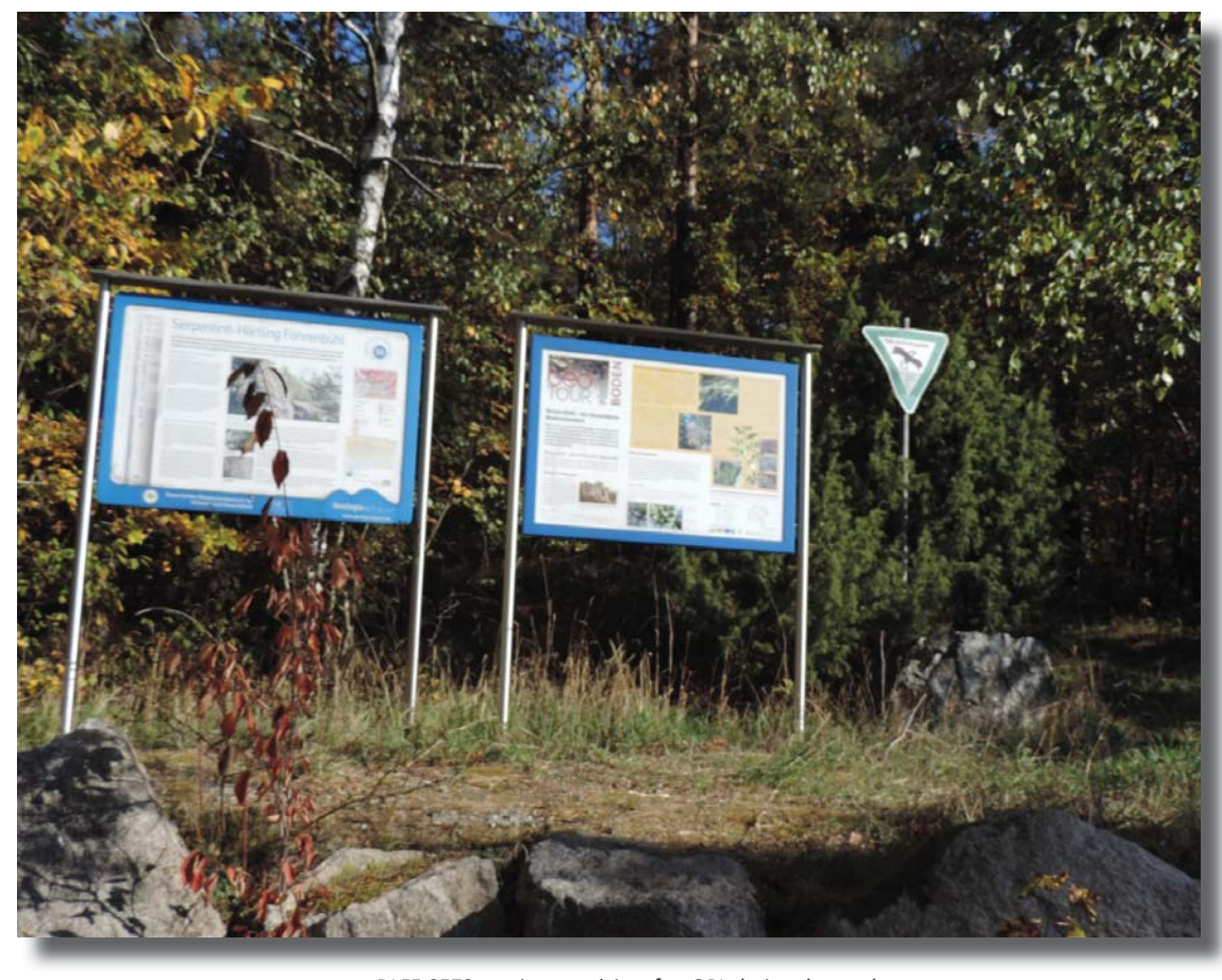
DLFF-0578, again an activity after QRL during the week

With the latest additions in 2018 also three areas in bavaria were added to the DLFF-listing. Anyhow far in october there was the plan to do some activity.