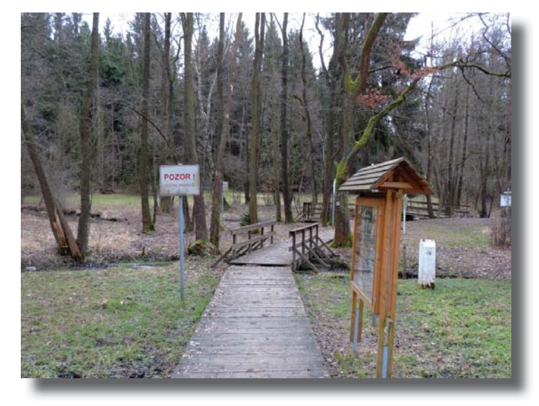
the green border to czech republic with a wooden-trail

meanwhile all areas without any handycap by foot/bike etc. The area is also covered by three different nature reserves. On the bavarian side DLFF-0216, on the saxonian side DLFF-0343 and on the czech side OKFF-0412. We