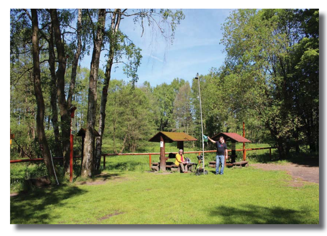
the station in Bystrina OKFF-0412 as OK8WFF/p run by Karl DL1JKK and Manfred DF6EX

In the early time of WWFF we made an activity from OKFF-0012 which resulted in more than 1000 contacts in 5 hours. Today propagations actually are not so good and of course due to the extreme high amount of new WWFFs, the interest is not so big to reach such results again. So we planned for a group-activity a total run with green power and reach a similar result, however this time from various areas.