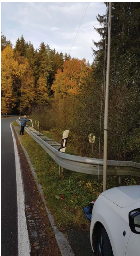
my xyl Christa just pulling down the long end of the windom-antenna

activation, so shack should be in the car. We could start a bit quicker than expected, as setup could be done easily on the first planned point, so at 1234 we were on the air with IW2BNA as first station. Interest was quick growing but also going down after a first small pile-up. Propagations again very changeable, almost nothing