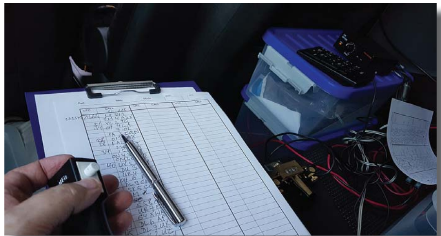
a bit quick and chaotic CW-setup on the backseat

The shortest way to the location was about 50 minutes from at home (if no construction site on the way) and leads via czech republic, through the city of Eger and leaving via Vojtanov into saxoniam. On the journey there we had no problems and reached in expected time and the only question was, where we could set up the station because the area along the road means, along the E41, one of the roads there with the highest traffic. So when checking the maps found the sidearm from the area leading to the small village Landwüst as most interesting parking-point, because the sun was shining but of course too cold for an outdoor-