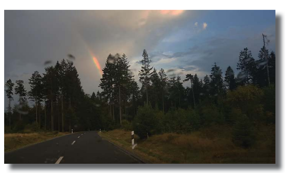
after leaving Waldstein-mountain the coming rainclouds with rainbow above Weissenstadt