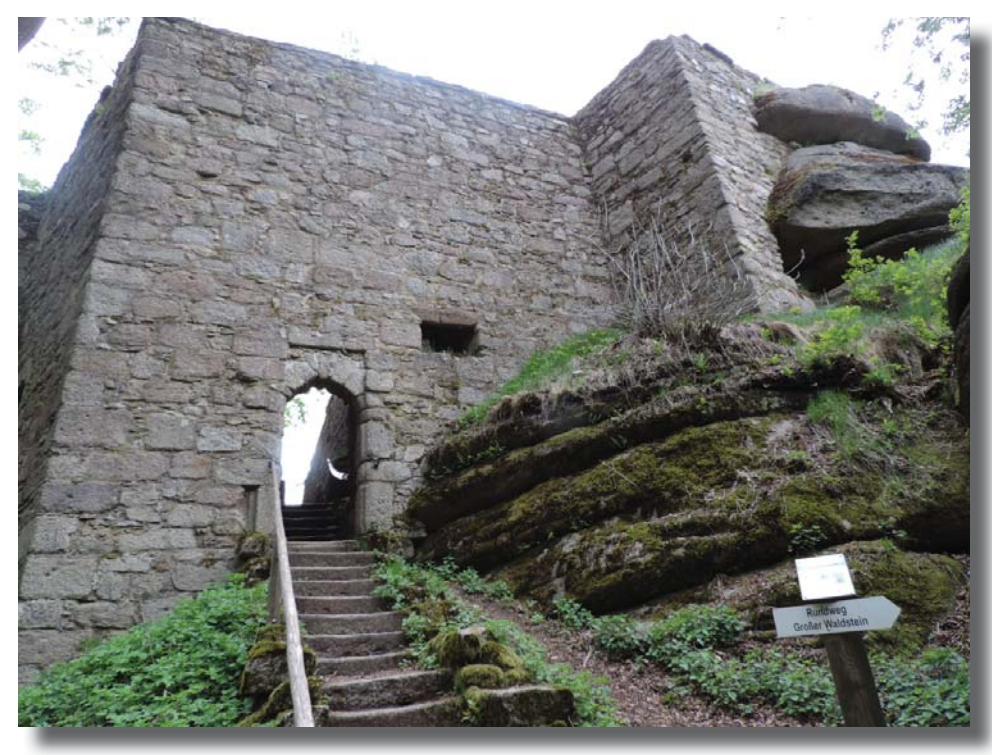
way into the base-assembly from DL-03141

ditions were bad, so after around 30 contacts I had the first time the intention to give up.