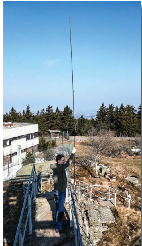
Felix DO3DKW setting up antenna for digimode-station