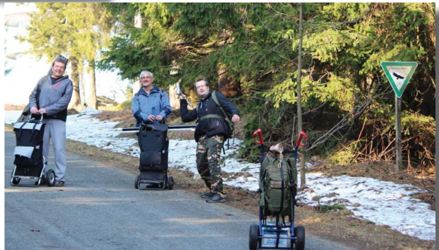
just at the begin of DLFF-0614, only a few meters more to the SOTA-spot.