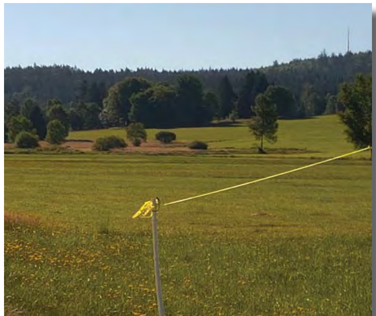
view to czech-nature-reserve Na pozarech 200mtrs away