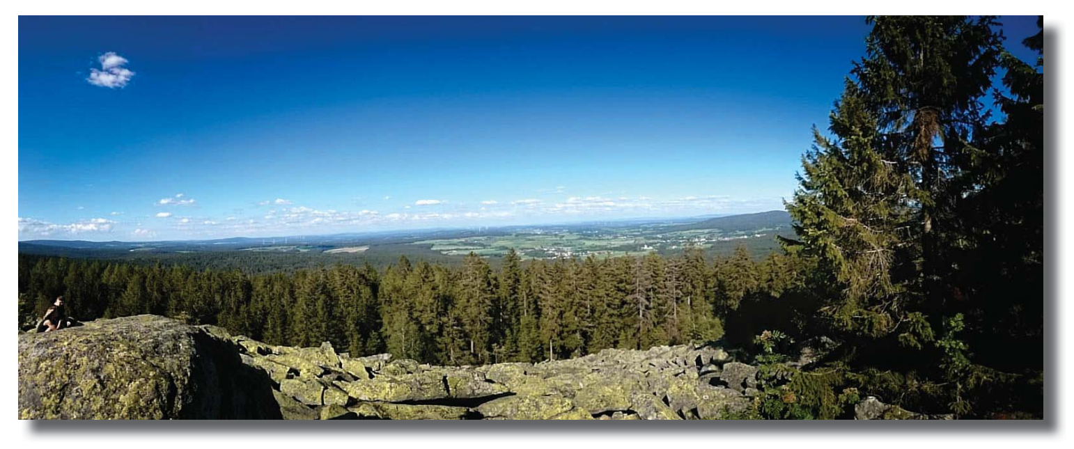
view into the block-fall from the top of the hll

After our mountain-trip in last year to DLFF-0614 we were ready for the next one. NSG Plattengipfel on a heigth of 895 meters asl